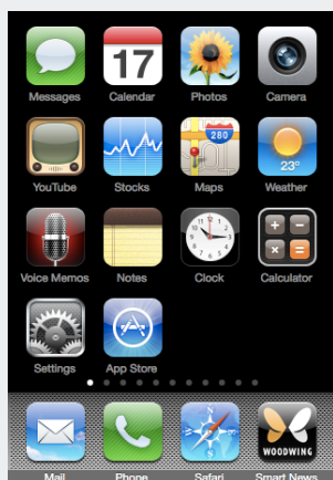
Example of WoodWing branded iPhone app. Imagine your own logo on your reader's iPhone.

WoodWing Europe Zaandam, The Netherlands info@woodwing.com